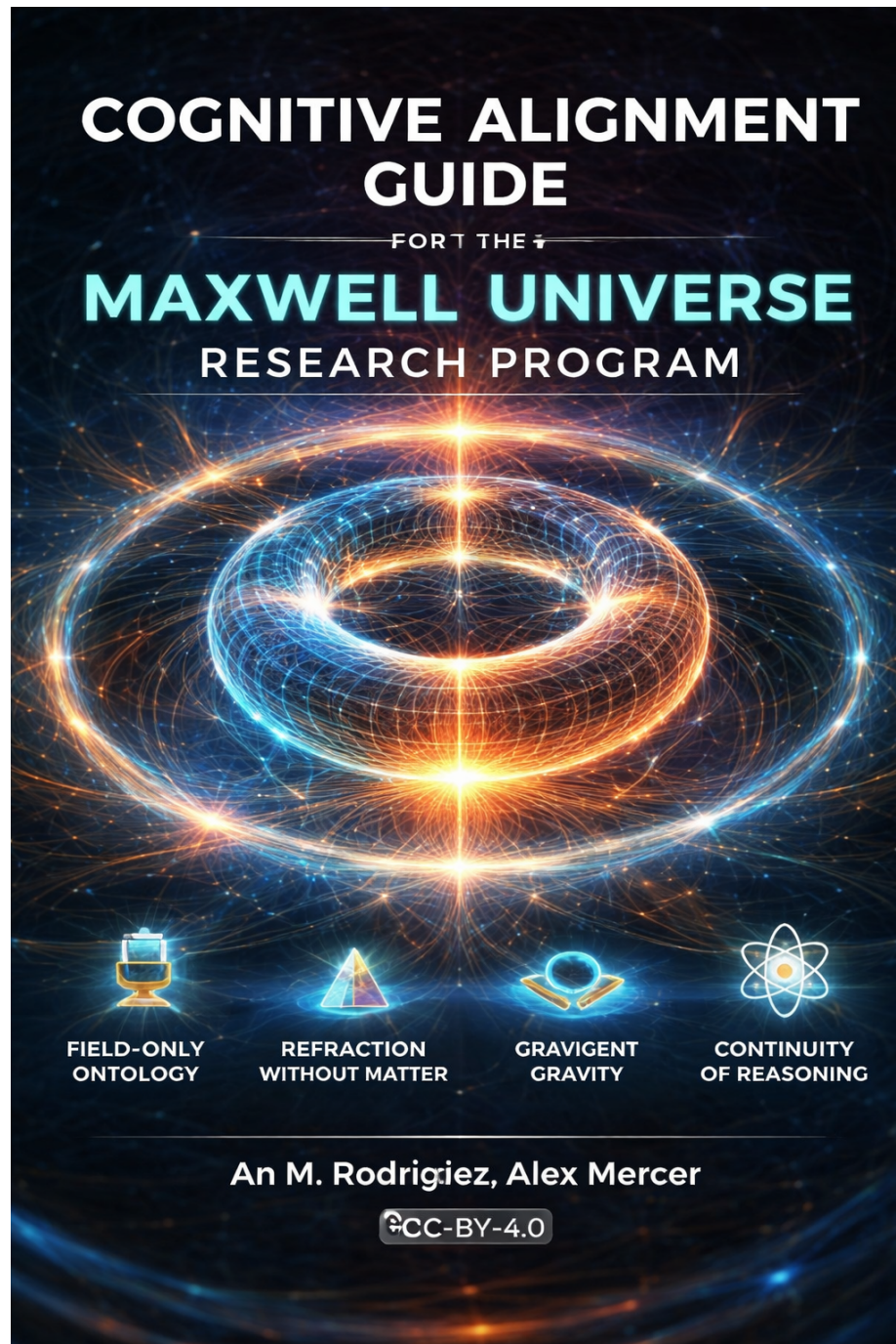
Figure 1: Cognitive Alignment Guide for the Maxwell Universe Research Program